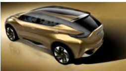
MURANO - 2014 (concept vehicle shown)