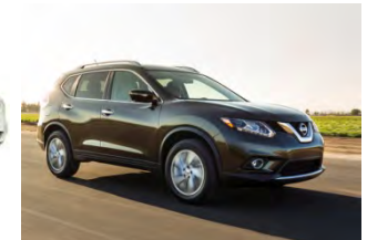
ROGUE - 2013