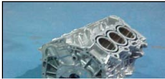
V6 Cylinder Blocks