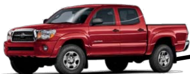
TACOMA (Baja Calif.)