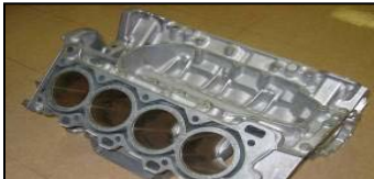
V8 Cylinder Blocks